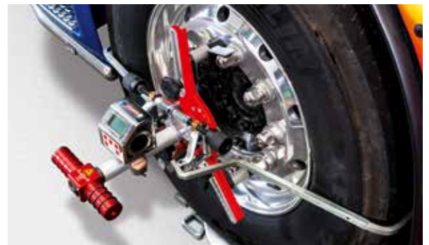
Laser head and electronic inclinometer