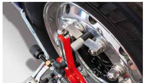
Retaining clips for aluminium rims