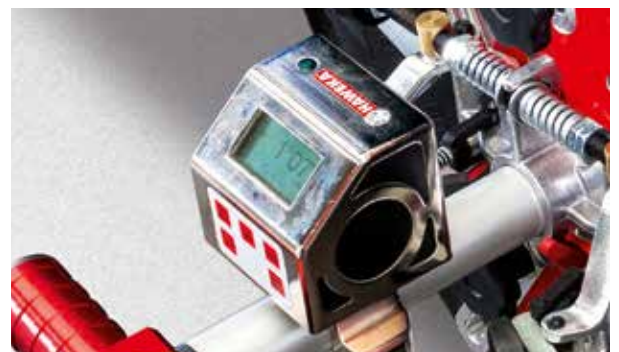
Inclinometer (electronic inclinometer)